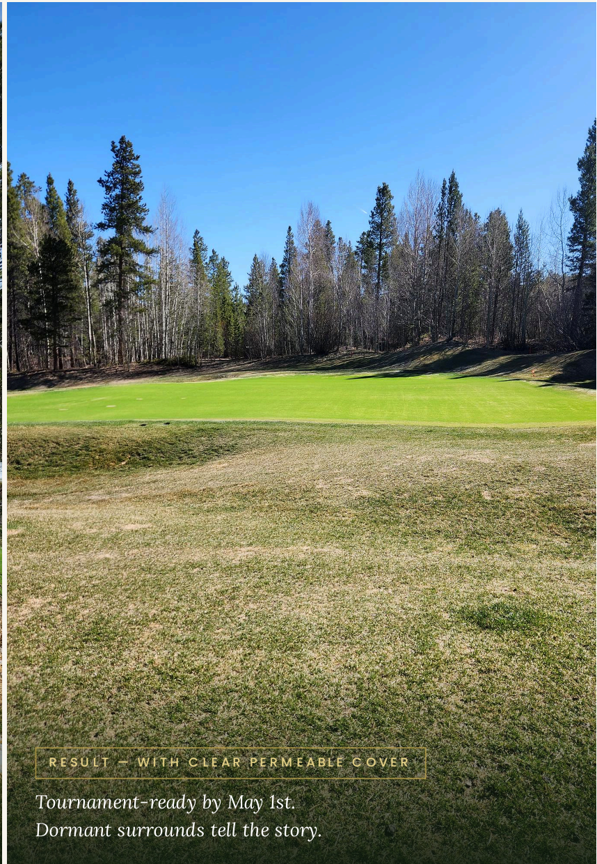
RESULT — WITH CLEAR PERMEABLE COVER

Vivid green turf while snow covers everything around it.