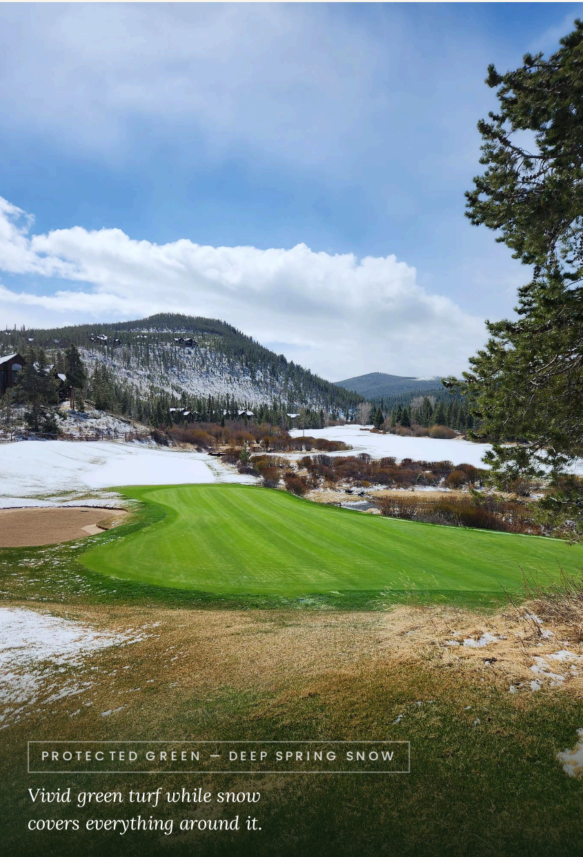
PROTECTED GREEN — DEEP SPRING SNOW

The contrast speaks for itself. Covered greens emerged vibrant and ready for play — weeks ahead of where they would normally be at this altitude.